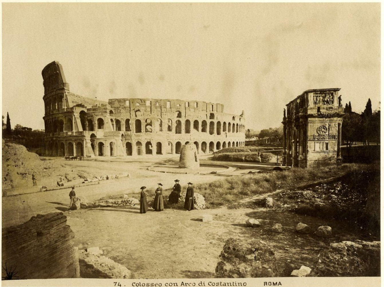
74 . Colosseo con Arco di Costantino ROMA

While this one shows it peeking through the Arch of Constantine: